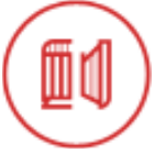
Swinging gate accessories