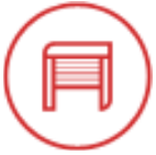
Rolling shutter accessories