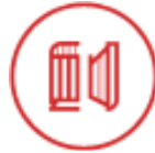
Common accessories for gates