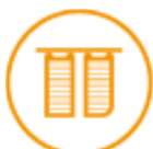
Sliding shutter accessories