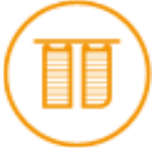
Sliding shutter accessories