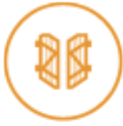
Wooden wing shutter accessories