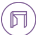
Menuiserie et agencement