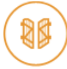
PVC and Aluminum wing shutter accessories