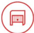
Garage door accessories