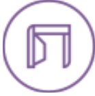
Menuiserie et agencement