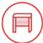
Rolling shutter accessories