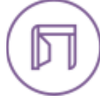
Carpentry and joinery