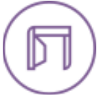
Carpentry and joinery