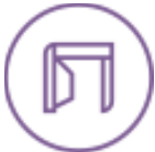
Carpentry and joinery