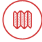
Volets battants et persiennes