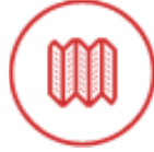
Volets battants et persiennes