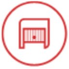
Portes de garages